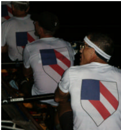
Cincinnati RC/Grand Rapid RA/Community Rowing after 160 km