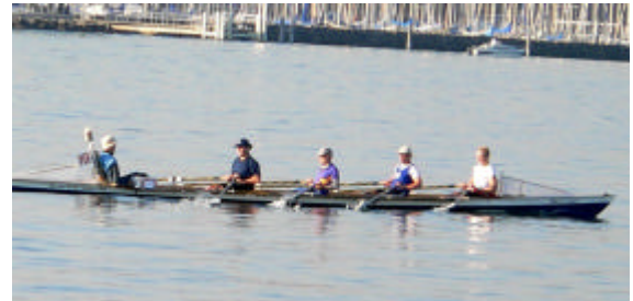
RGM Bonner RV/Mainzer RV, the Winners