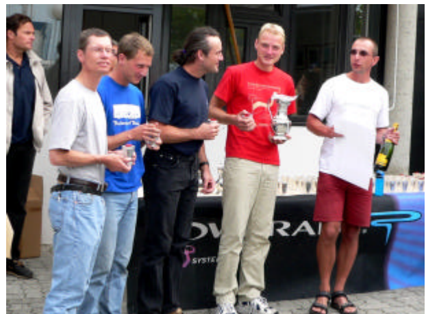
RGM Bonner RV/Mainzer RV, the Winners