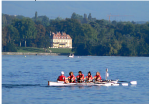
Excenvex Skiff