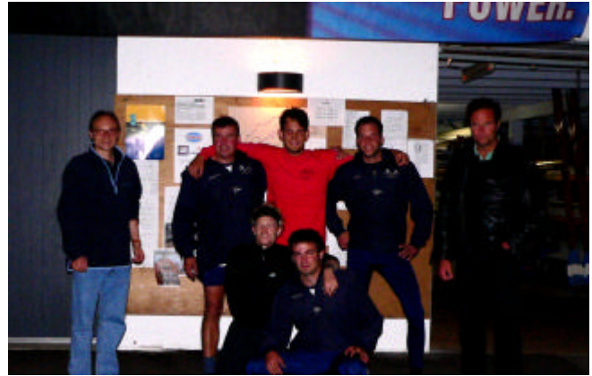
RGM Düsseldorfer Ruderverein 1880 e.V./Ruderverein Pädagogium Godesberg e.V.