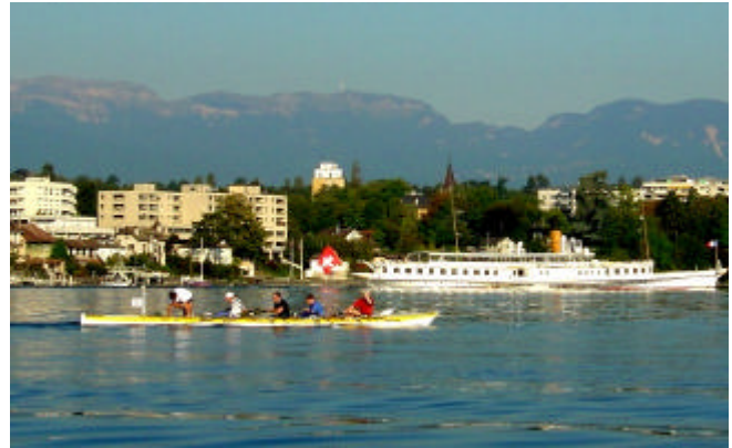
RGM RG Wiesbaden-Biebrich/RC Raststatt 1898 e.V./Köln Club für Wassersport e.V.