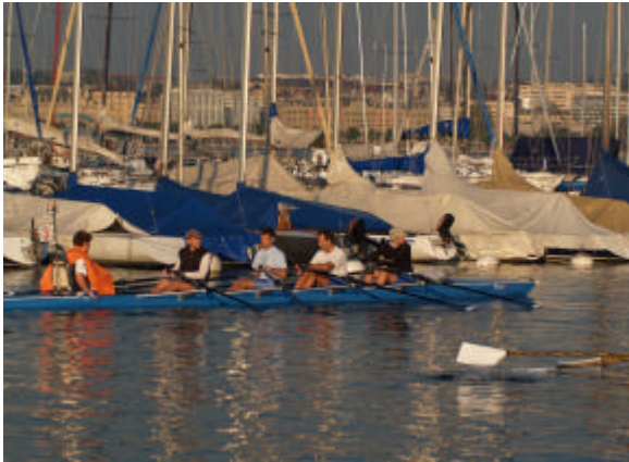
SNG/RCL/ Amitié Plein -Air St Fargeau Crew