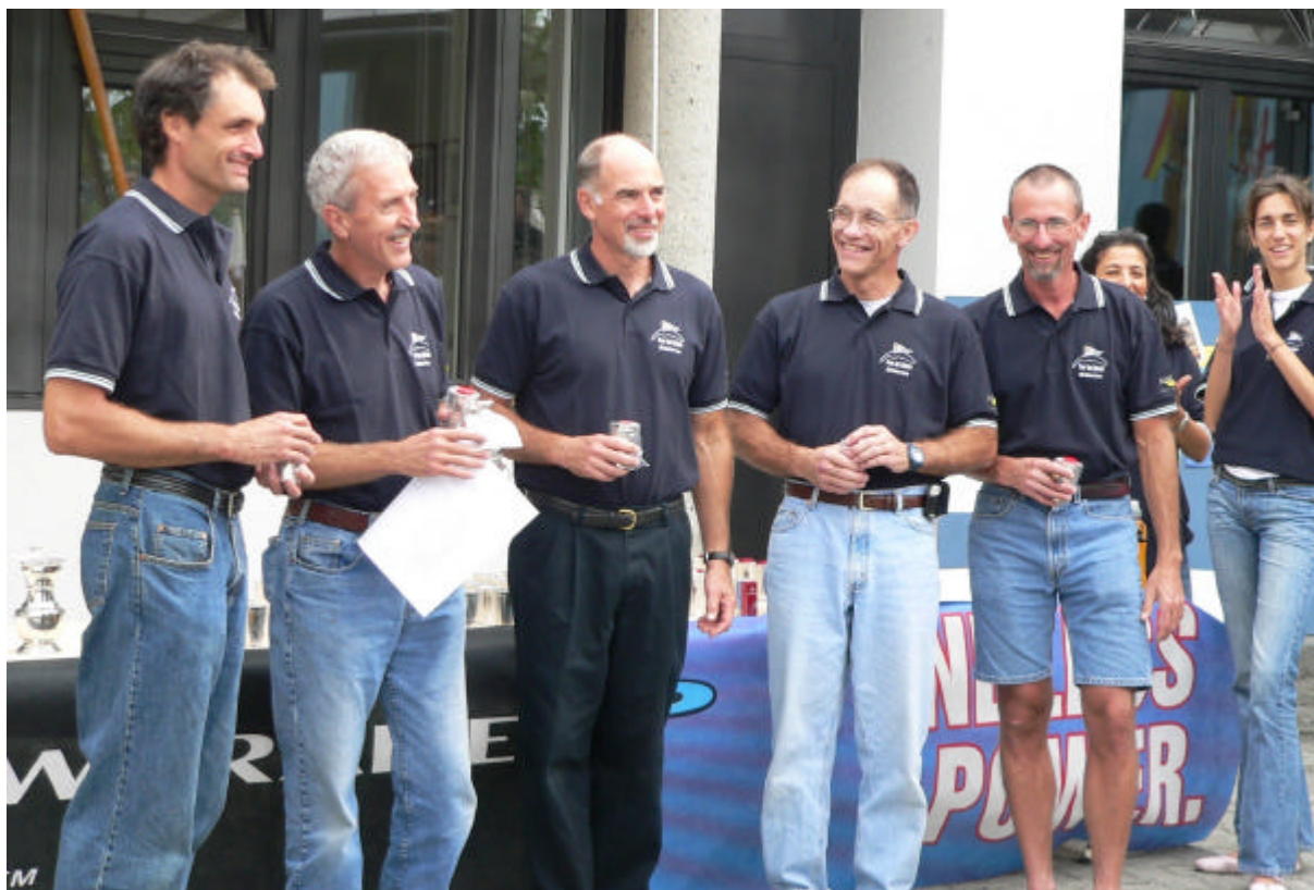
Composite Cincinnati Rowing Club / Grand Rapid Rowing Association / Community Rowing Record 2005 Masters - Maîtres