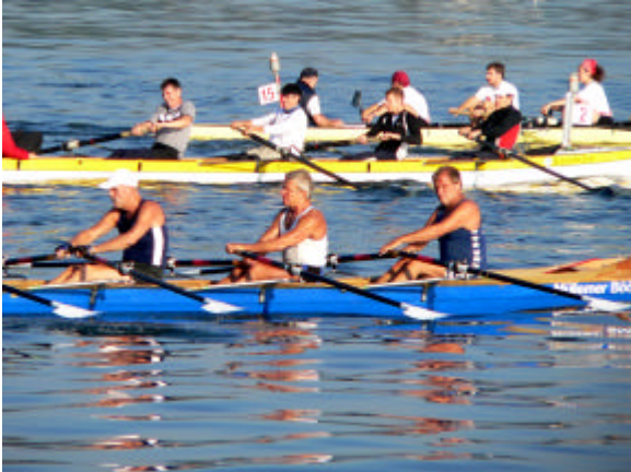
RGM Ruder-Klub Germania e.V. Köln/RTHC Bayer Leverkusen/Köln Club für Wassersport e.V.