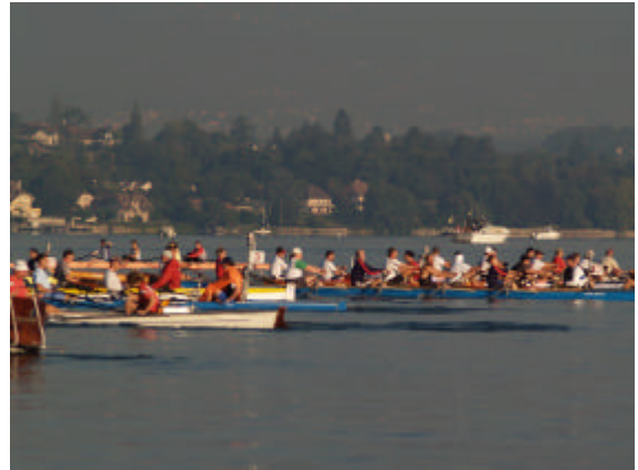
The first stroke of the 2005 Tour