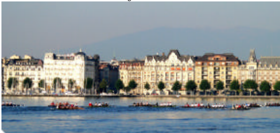
The participants at the first control mark