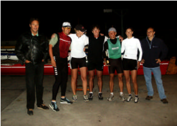
RGM WSV Godesberg/Karlsruher RV Wiking/Külker Budapest