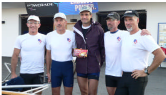
Cincinnati RC/Grand Rapid RA/Community Rowing