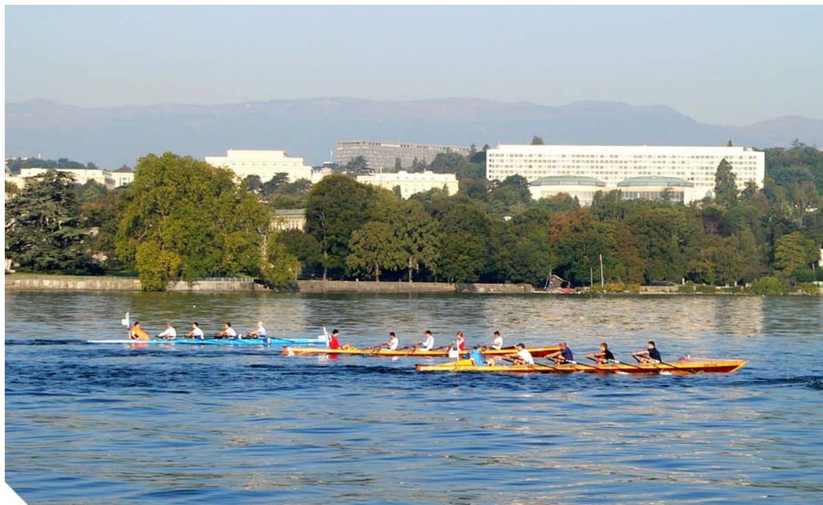
The Crews along the UN premises